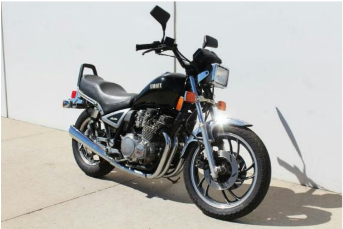
1982 Yamaha Maxim 750

Bikes owned: 1982 Yamaha Maxim 750, a 1985 Yamaha Venture Royale and a 1998 Kawasaki Concours