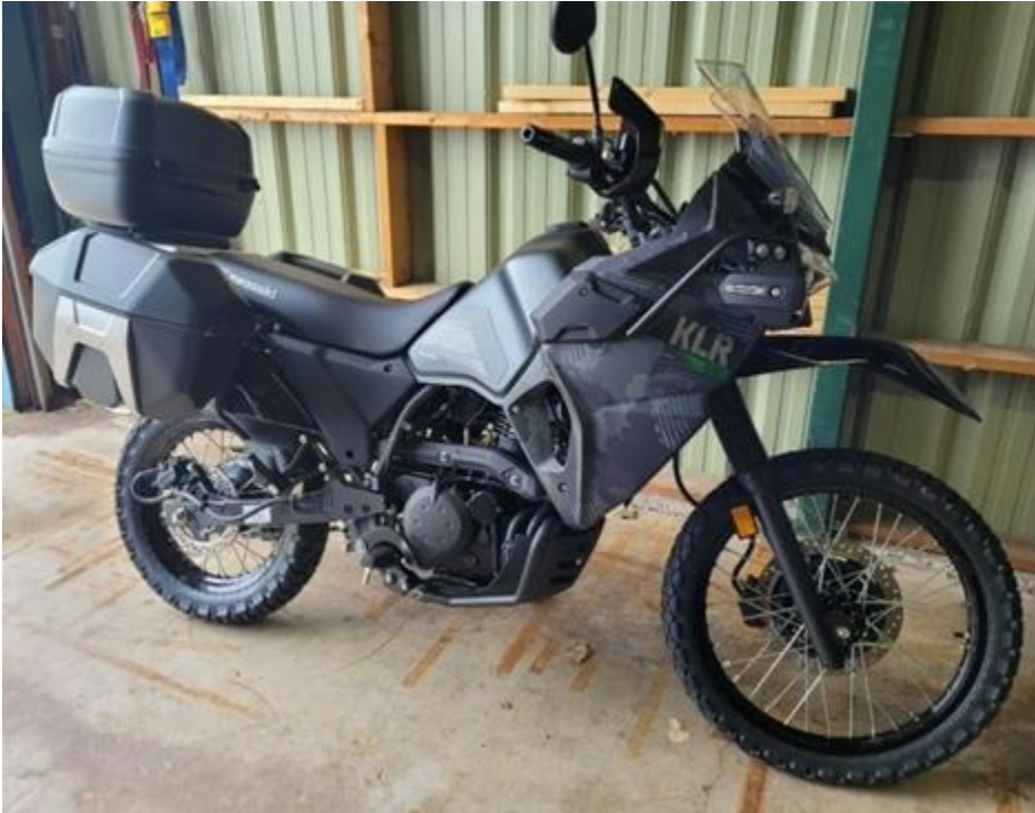
2022 Kawasaki 650 KLR

I was appreciative of winning the Rookie of the Year Award; Presidents Award (4 consecutive years); Most Valuable Member Award. President (4 years) Board Member ( I think 8 years) and Race Track Coordinator(6 years)