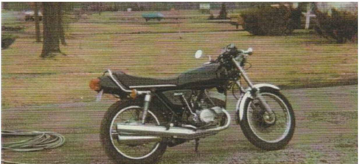
1971 Kawasaki 500 Triple