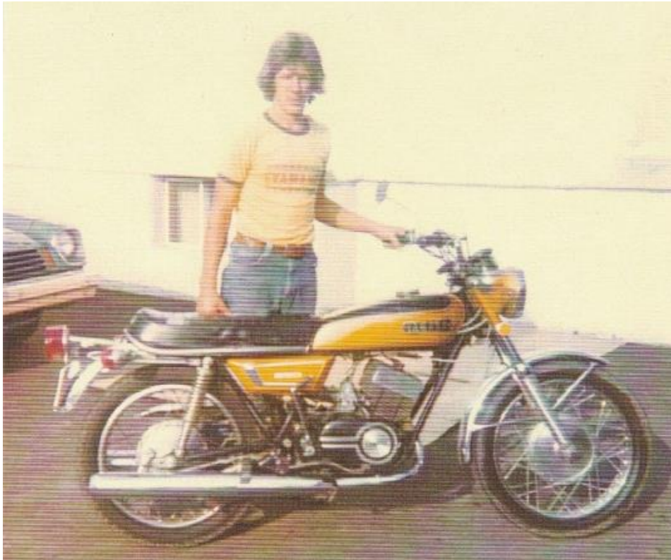
1972 Yamaha DS7

I maintained the Speedway Gate for 28 years, assisted with construction all steel roofs on all the buildings, assisted in building the new bathrooms in Clubhouse, organized Mud Run 1999 – 2003, Corner Marshall for many years and many jobs thru out my tender.