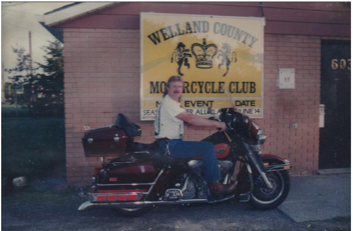
1986 Harley Electric Glide