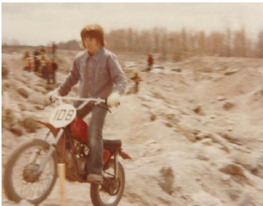
Started Riding Trials in the Robin Hood