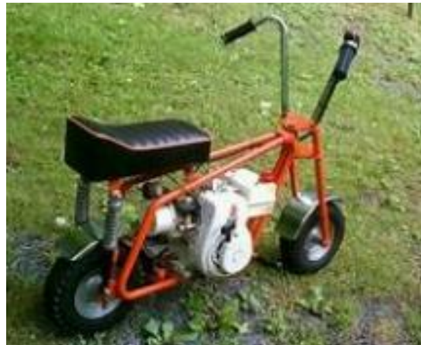
Sears 1970 Mini Bike