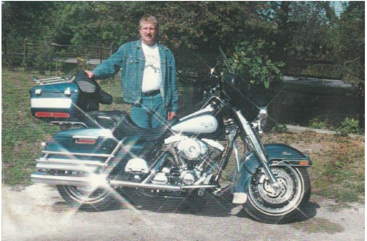
2001 Harley Electric Glide

I'm proud to be a long time member of the WCMC