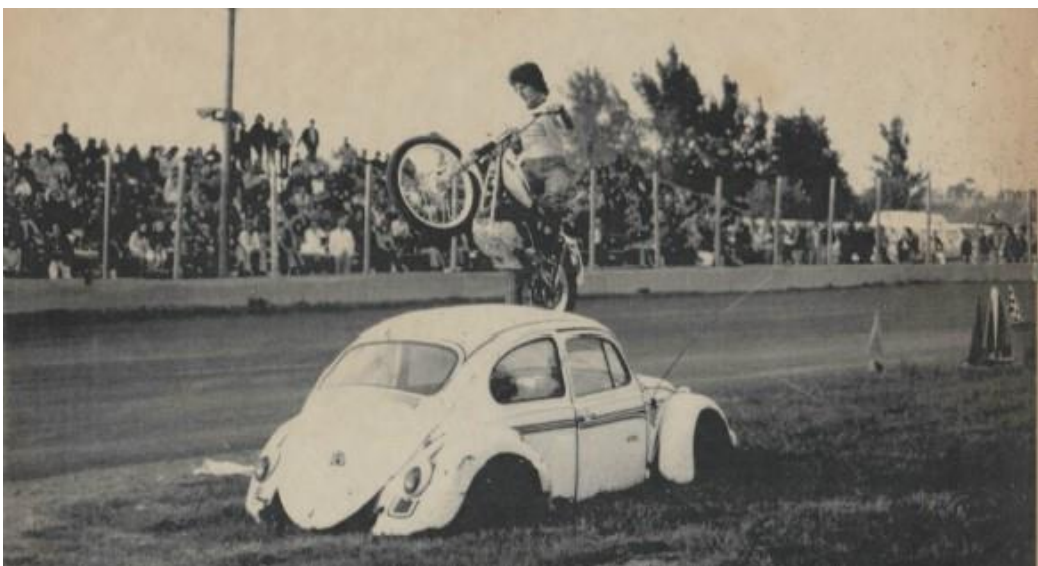
Riding over a Volkswagen during the half time show at Welland County Speedway

I took a 30 year break, I am now competing again for 11 years after starting back again in 2013.