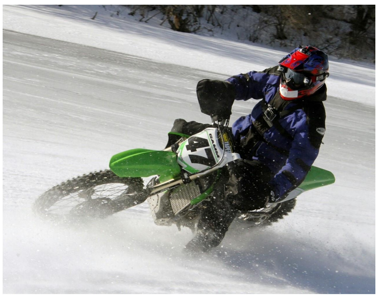
KX 450 Kawasaki MC in the Summer and Ice Racing in the Winter