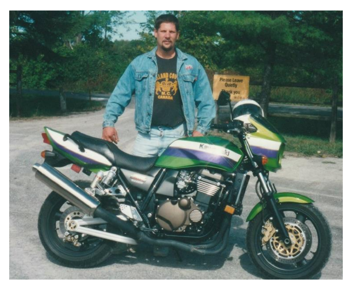
ZRX 1200 Kawasaki

I have been a board member, and part of a team that ran the MX track and built the new washrooms. Have done staging at the races for many years, put on Trials events, Mud Runs, Field Days, etc. and hosted Trap Shoots.