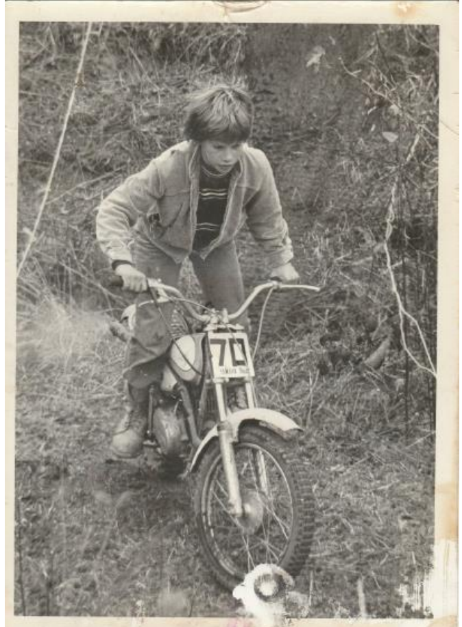
TY 80cc Yamaha Trials Bike

My TY 80cc Yamaha Trials bike started me on a path to developing my skills as a Trials Rider.