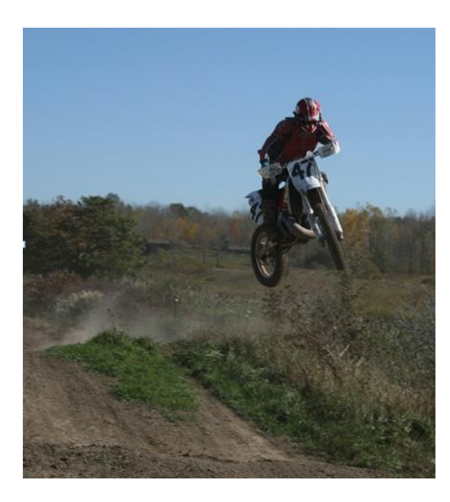
High Flying on the WCMC MC Track