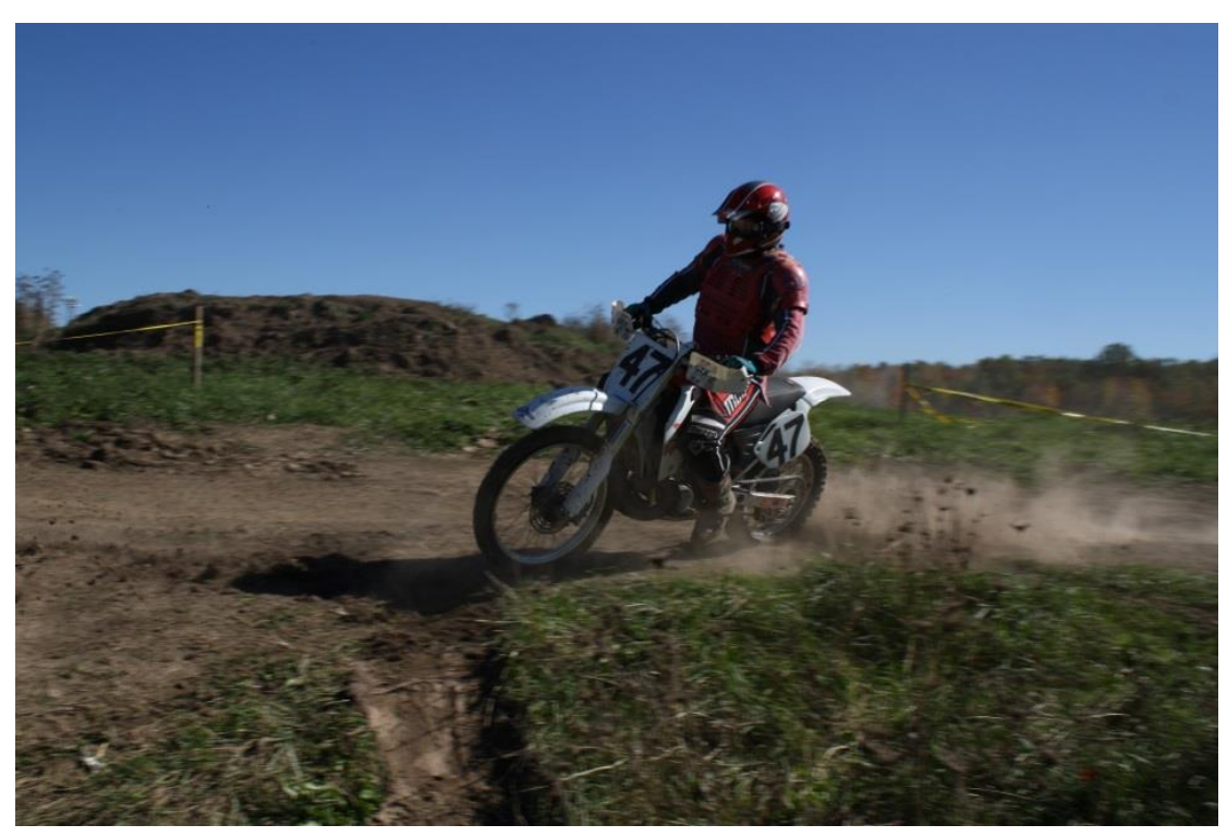
CR 500 Honda

Trail riding, ice racing, trials, hare scrambles, hill climbs, dirt track, motocross and going fast on two wheels (not just when outrunning the law).