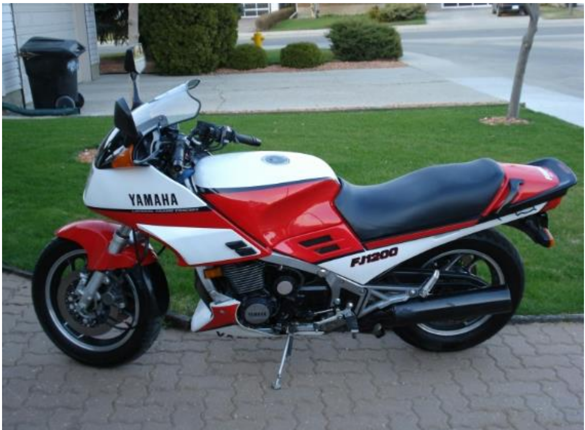
1986 Yamaha FJ 1200

I am proud to be a long time member of the Welland County Motorcycle Club.