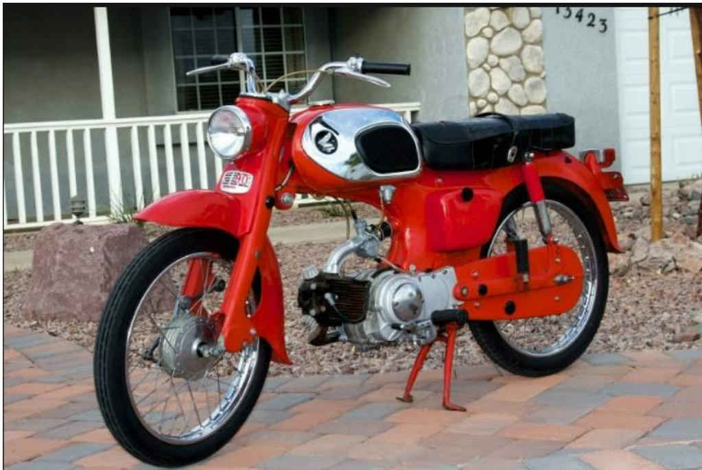
1965 90 cc Honda