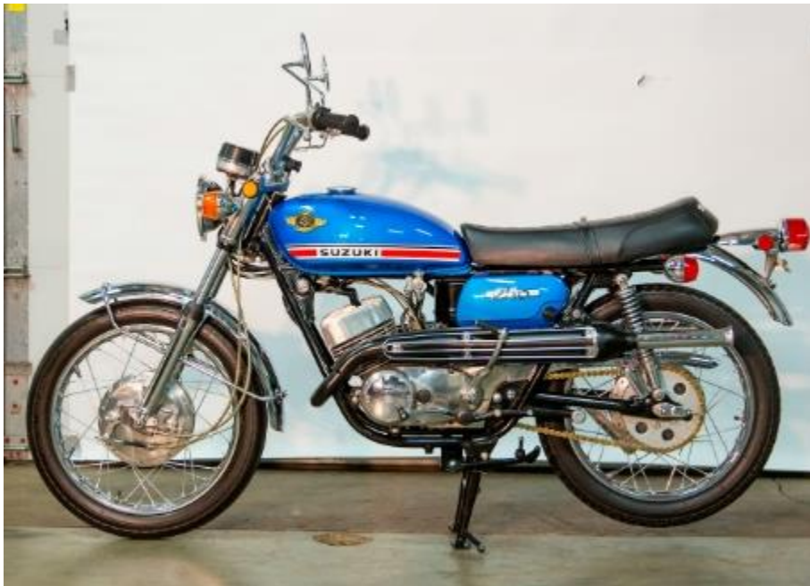
Suzuki T 250 Hustler

Bikes owned: 1970 Suzuki 250 Hustler, 1973 Yamaha 500, 1978 Yamaha SR500, 1969 BSA Rocket 3, 1960 Triumph Hardtail Copper, 1973 Ironhead Harley Sportster, 1981 Goldwing Interstate, 1969 Kawasaki KZ 1300 – also known as the beast. 1968 GL 1000, 2004 HD Softail Standard