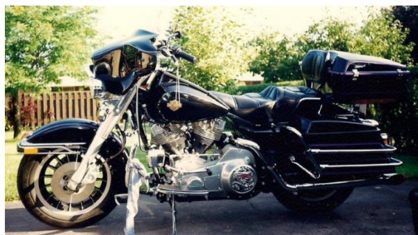
1985 FLHT Electraglide Harley Davidson