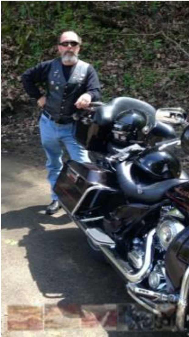
Taking a break from riding my 2011 Road King

Some of the best fun we've had is best left unsaid. All I will say is that we made it and we are a little worse for wear BUT it was worth it.