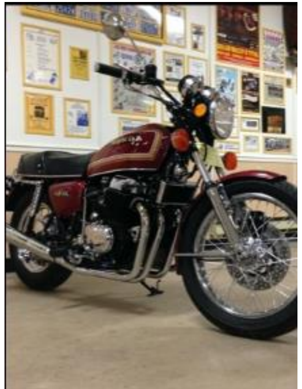
My restored CB 750 Honda in the clubhouse for the Biketoberfest Vintage Bike Show.