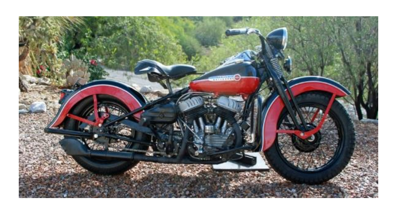
Mid 40s Harley Davidson 45 c.i.

Bikes owned: Briggs Kick Start Scooter – mid 50's, Harley Davidson Flat head 45ci mid 40's military bike, 1939 Indian Side-valve, 1950 Norton 500, 1965 BSA 500 Goldstar, 1962 Triumph 500, 1967 650 Triumph Bonneville, 1978 Suzuki 750, inside 4 cylinder, 1984 Honda Goldwing 1200, 1995 Virago 1100, 1998 1500 Suzuki intruder, Bennali 50cc Dirt Bike, 2005 Suzuki Blvd 1500.