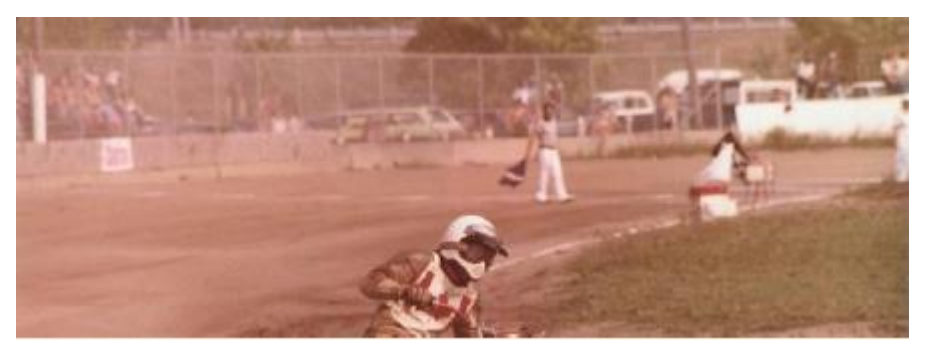
Note the Canadian Flag we wore when participating in the CanAm Challenge.

I raced in events for 4 decades as a speedway motorcycle racer. Had I raced one more race after 2010, I would have raced for 5 decades but there's still a chance!! After a bad race injury in '08, I retired from racing and worked as a corner Marshall in turn 1 up to present.