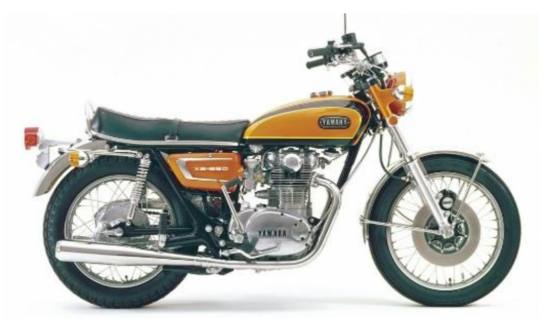
1970 650 Yamaha

Bikes owned: 1970 Yamaha 650, 1975& a 1977 Harley Davidson Superglide, 1981 Honda CB Custom 750, own & ride this vintage Honda, 2017 Honda CB1100, multiple speedway motorcycles.