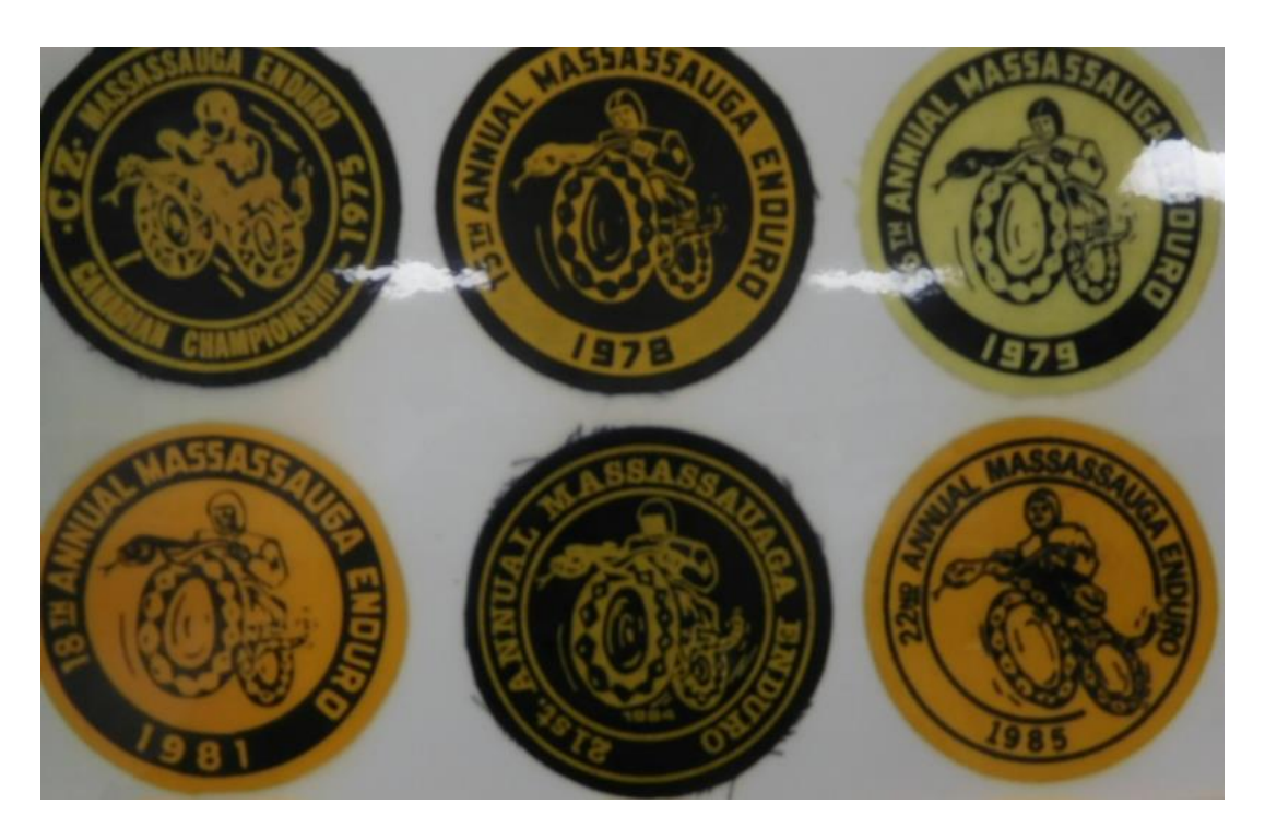
Massasauga Enduro Crest

I originally joined the club because I was riding enduro to be more involved with the club. I started helping layout the enduro at that point.