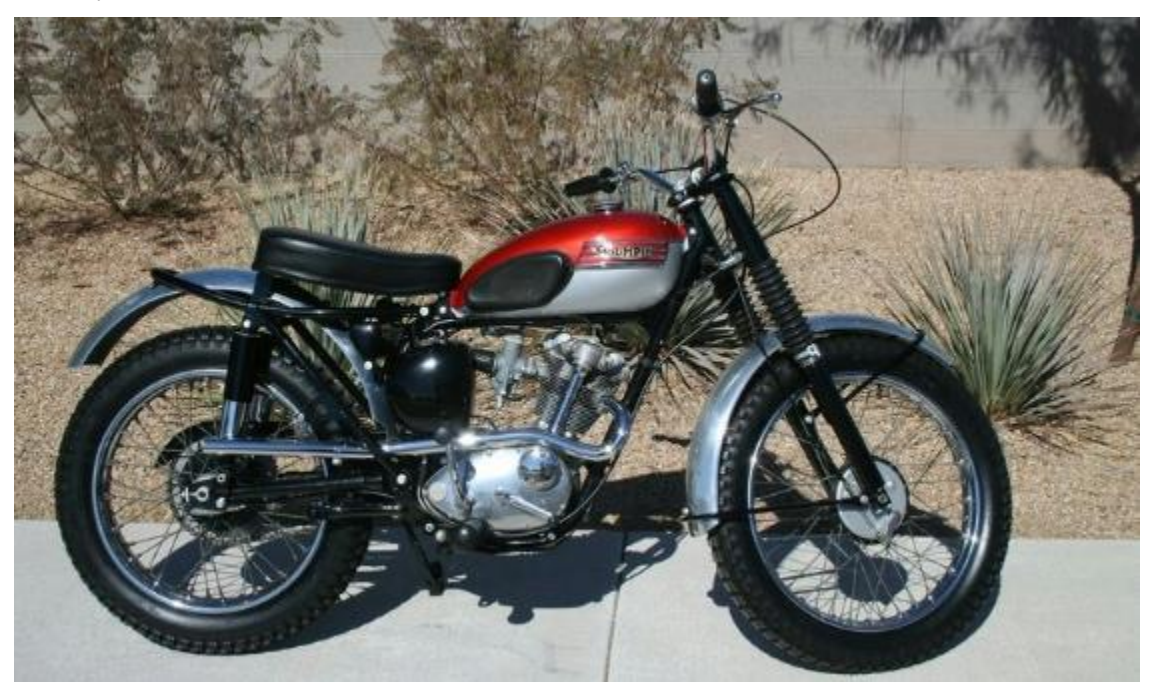
250 Triumph Tiger Cub

Bikes owned: 250 Triumph Tiger Cub, 250 Ducati, 650 BSA Lightning, 360 Bultaco Astro, 500 Yamaha SR, 650 Triumph Bonneville, 500 Yamaha TT, 175 Yamaha IT, 250 Yamaha IT, Honda CB 1000, 1984 Gold Wing, 883 Harley Davidson Sportster, Honda 550 Ascot, 2006 Harley Davidson Dyna, 2010 Harley Davidson Street Glide, 450 CRF Honda, 250 CRF Honda, 2012 Kawasaki Concours, 2014 Kawasaki Concours and a 2016 Kawasaki Concours.