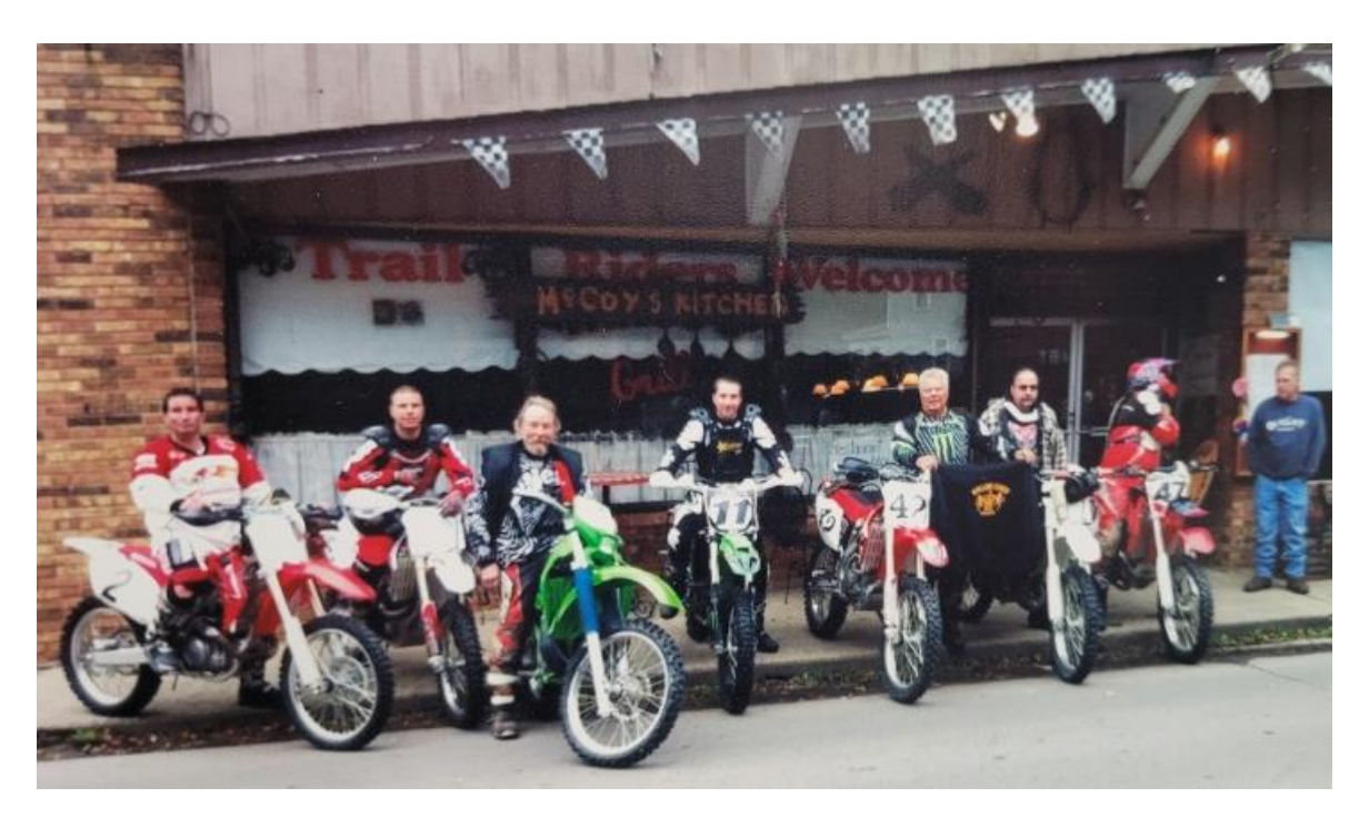
Hatfield and McCoy Trail Rides