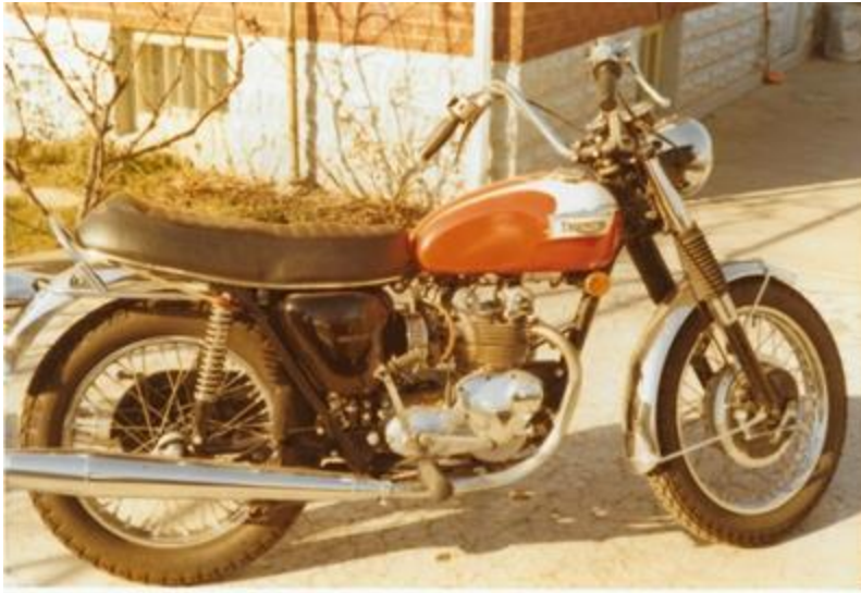
Triumph Daytona 500

In 1973 I bought my Triumph Daytona 500, next was the 750 Bonneville and the 750 Trident Triple.