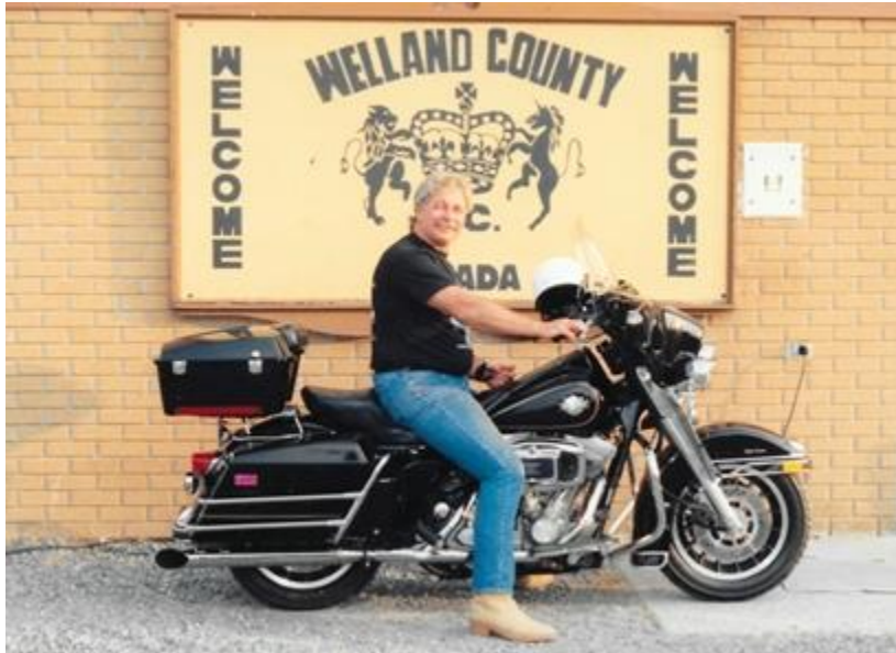
1985 Harley Davidson FLH

Projects involved with: Grand stand extension, Club Pavilion, Club House Addition, Pole Barn, Food Booth, Track Fencing, Track Maintenance, Security, Annual Banquet, Harley Demo Rides, Campgrounds, Children's Christmas Parties, Races and General Club Maintenance.