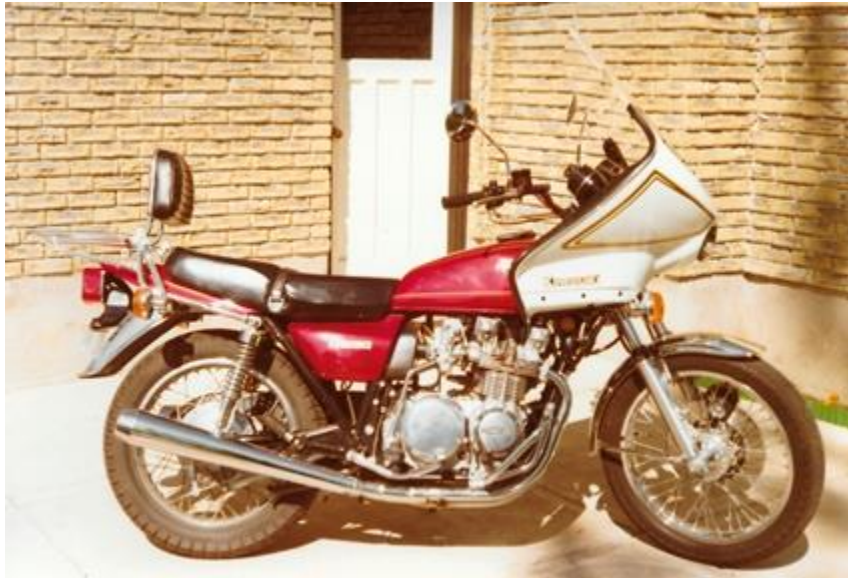
650 Kawasaki KZ