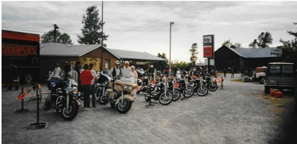
Harley Davidson Demo Rides