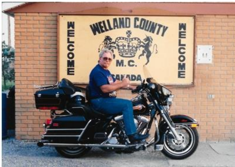
1992 Harley Davidson FLH