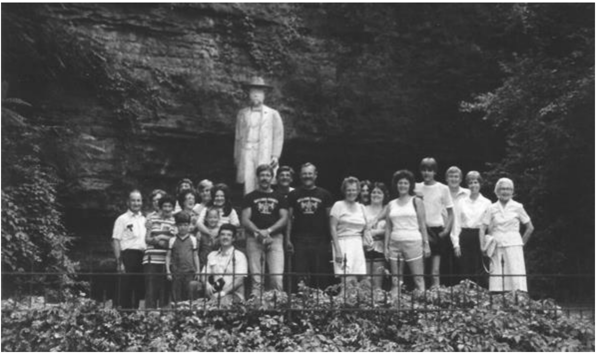
Trip to the Jack Daniels Distilleries