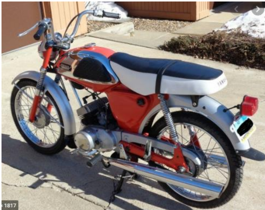
1966 Yamaha 2 Cylinder 2 Stroke

Bikes owned: 1966 Yamaha 175 (off road), 1974 Honda CB 450, 1973 Triumph Daytona 500 , 1973 Triumph Bonneville750, 1973 Triumph Trident 750 Triple, 1975 Kawasaki H2 750 Triple, 1976 Kawasaki 650 KZ, 1980 Kawasaki 1000 J1, 1985 Harley FLH, 1992 Harley FLH, 1995 Harley Road King, 2008 Harley Street Glide and a 2010 Triumph Thunderbird 1600