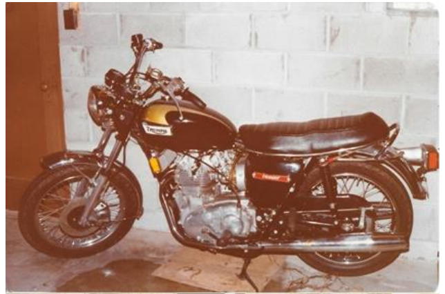
Triumph 750 Bonneville and 750 Trident