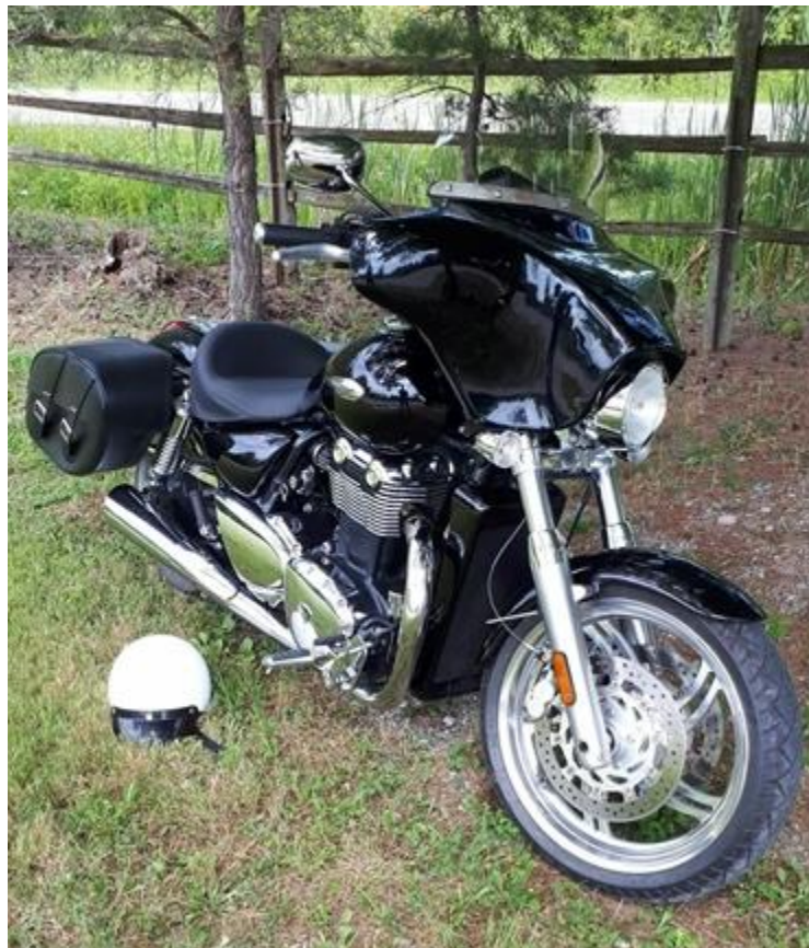
2010 Triumph Thunderbird 1600