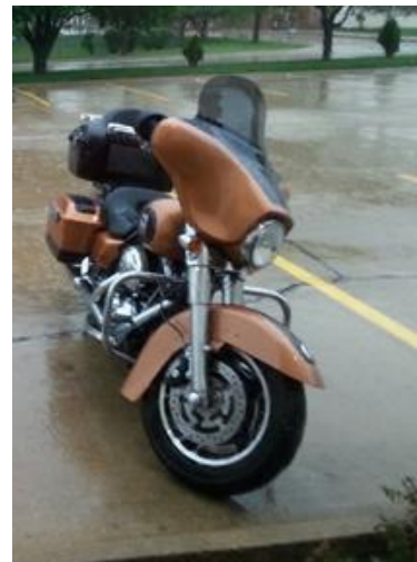
2008 Street Glide