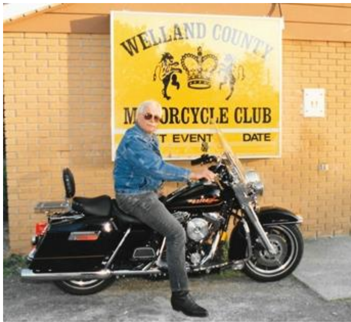
1995 Road King