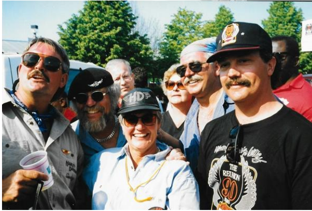
Willie G. Davidson Photo Bomb