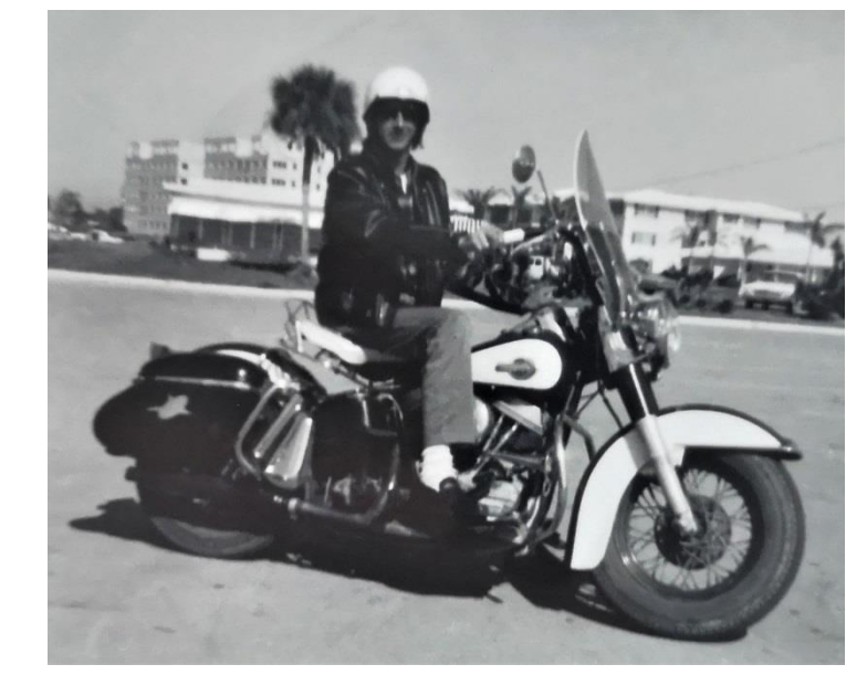
1940 Indian Scout